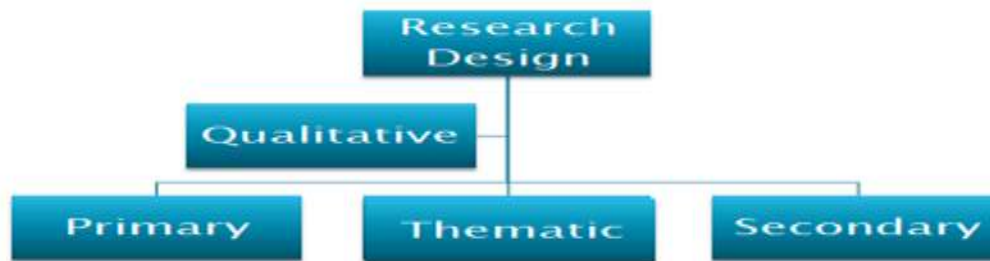
Figure Error! No text of specified style in document..2 : Research design